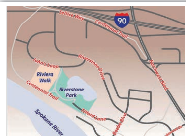
Riviera Walk is located in Riverstone, off John's Loop, adjacent to Riverstone Park.