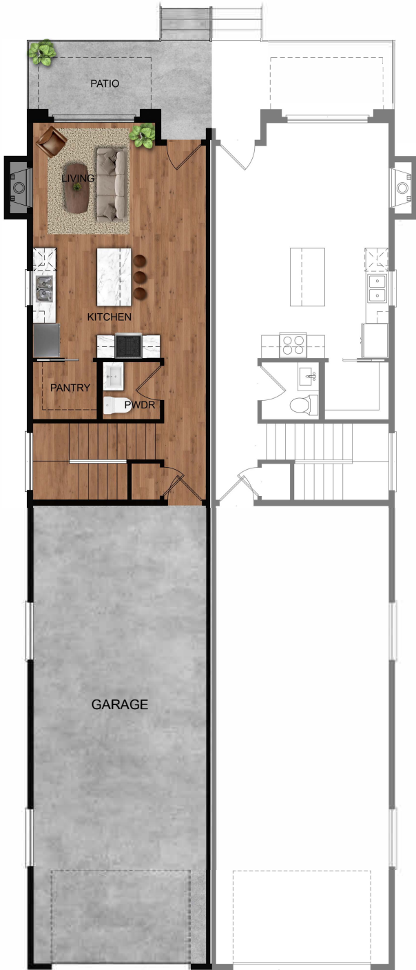
PLAN C - LOWER FLOOR PLAN