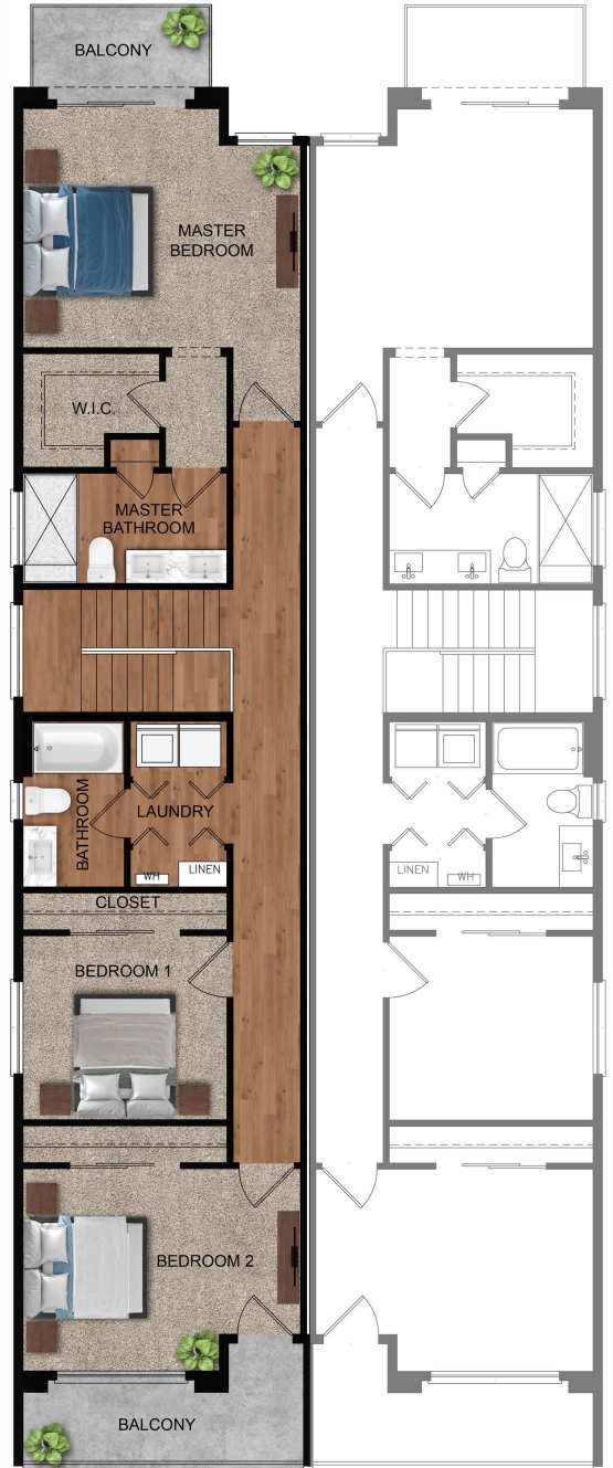
PLAN C - UPPER FLOOR PLAN